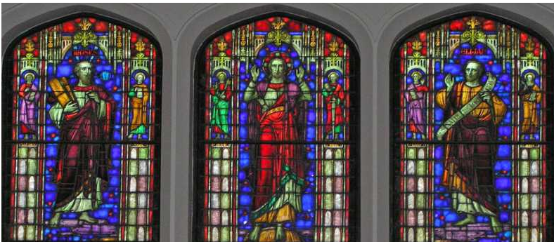
Stained glass window at Christ UM Church, Charleston, WV

If your gift is to encourage others, do it! If you have money, share it generously. If God has given you leadership ability, take the responsibility seriously. And if you have a gift for showing kindness to others, do it gladly.