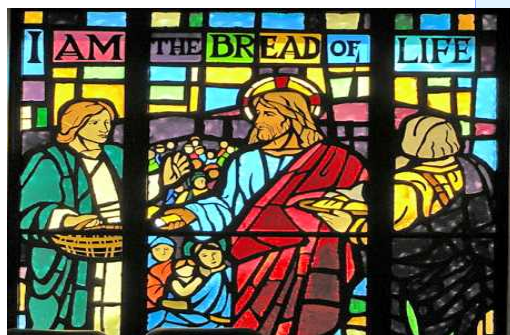
Stained glass window at St. John's UM Church, Scott Depot, WV